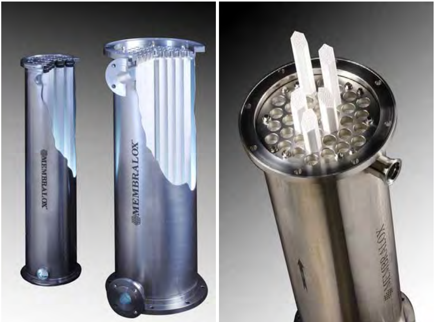
Membralox® filtration modules with ceramic membranes

Data calculated from an effluent at 4% solid contents, based on 2.5 % losses on fresh coating production.